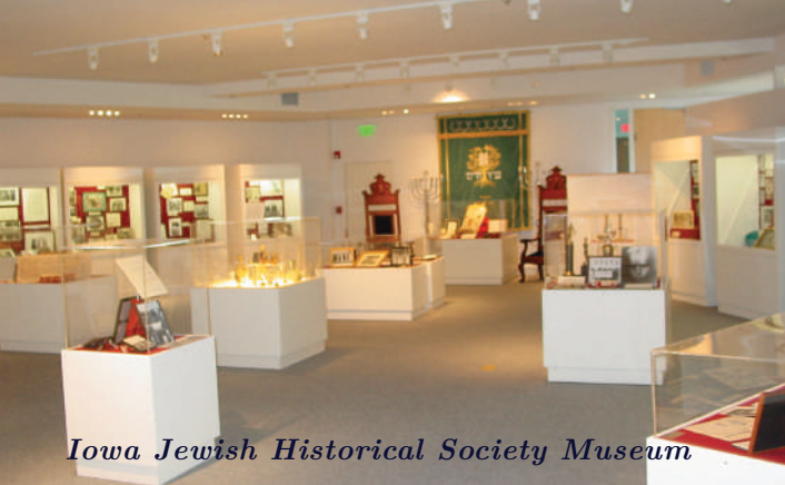
Iowa Jewish Historical Society Museum